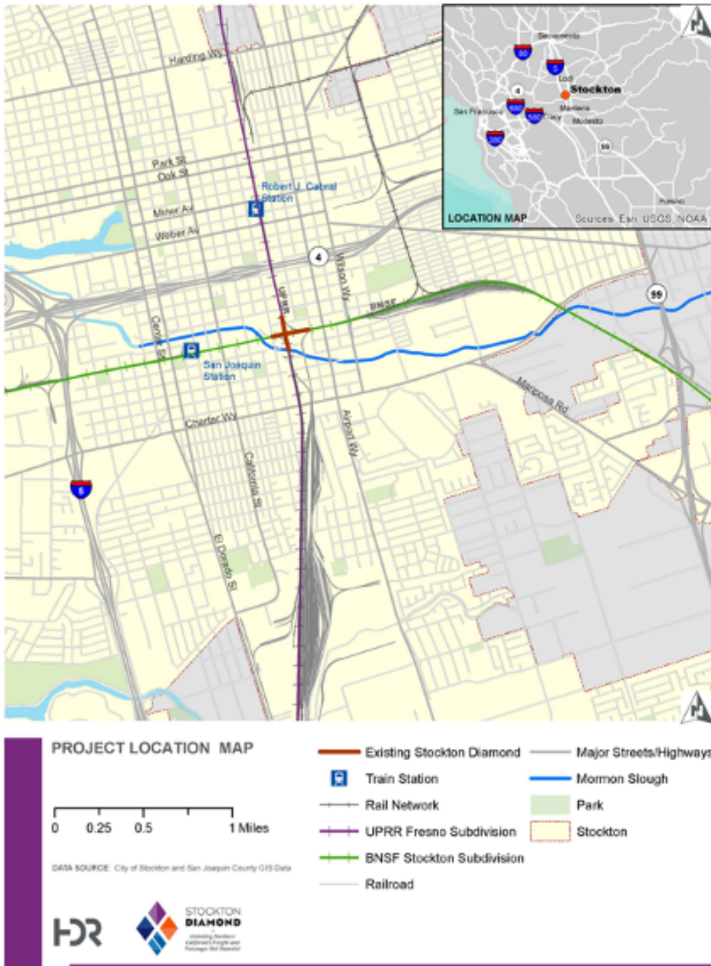
Figure 1 Project Vicinity